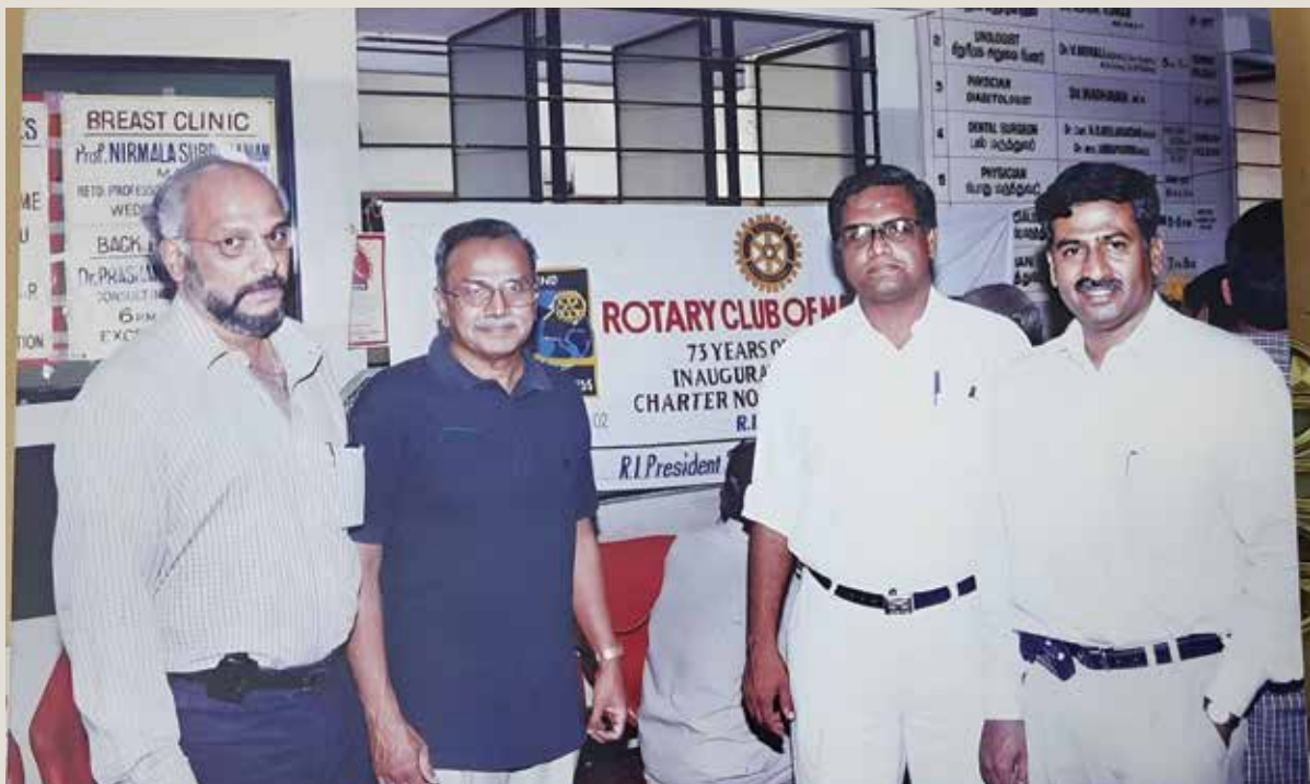
A medical camp at Hande Hospital during 73rd year of RCM.

#cleanerplanet #clothesdonation #reducepollution #greenplanet #makeadifference